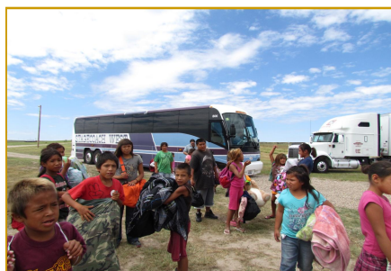
Here they come!! Praise you my Father. To Him all the Glory is given.