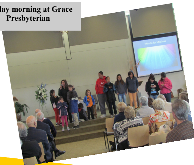
Sunday morning at Grace Presbyterian

For a colored printed newsletter please visit waeministries.com and PRINT!