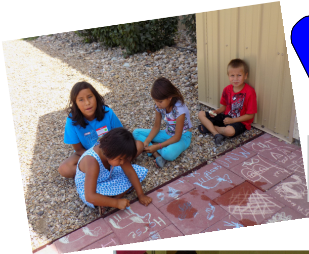
At the Dream Center