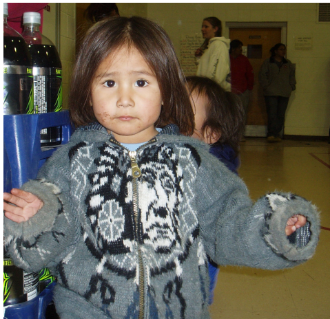
Feeding the hungry