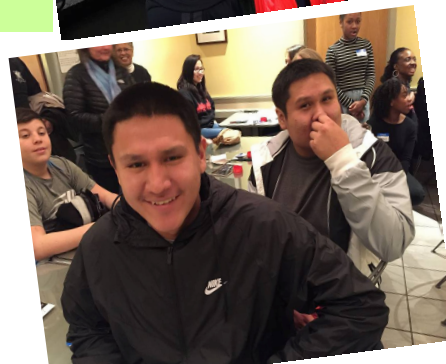
Times Square Church Pizza Party!