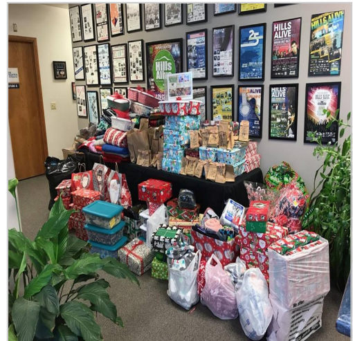
At KSLT Power 107.1, Rapid City

The Dream Center Christmas was so successful, thanks to our friends and partners of this ministry. KSLT Christian Radio who sponsored WAEM again this year for the event did a great job! A few hundred gift boxes came into the studio! We were so blessed to see the generosity of many local families and churches. The local food bank was able to have over 9000 lbs of food the ministry purchased ready to pick up. The teams then bagged the food and we feed over 630 families and seniors. We also had a drawing for cakes, pies, turkeys and hams. It was one of the biggest outreaches for food distribution this year. The amazing smiles and faces of these families who have nothing to give this time of year blessed all of us!!! We are so grateful to you all!! ~~~~