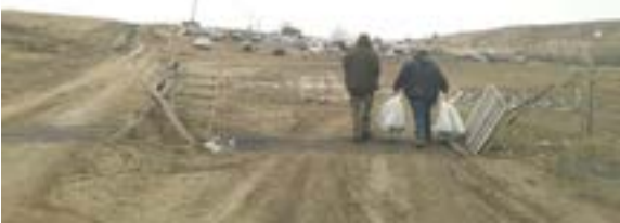
Walking like Jesus to bring food and water to those in need. Matthew 25

HOPE .....our journey continued this month, a month of pictures to show our desire to walk as Jesus walked amongst them, to always be used...available to bring His hope. Harsh reality is that there are still Lakota families stranded and hungry after the harsh March and April flooding. Thank the Lord we have you all as partners and friends on our team! You have shown so much love through your prayers and giving.