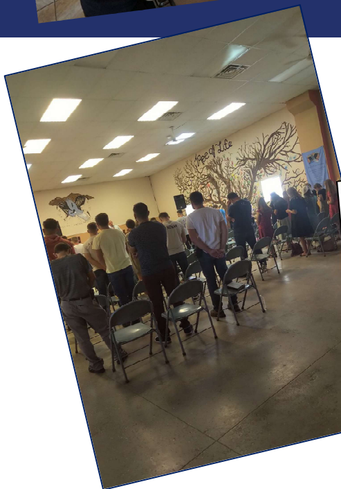
Love the sounds of worship at the Dream Center!