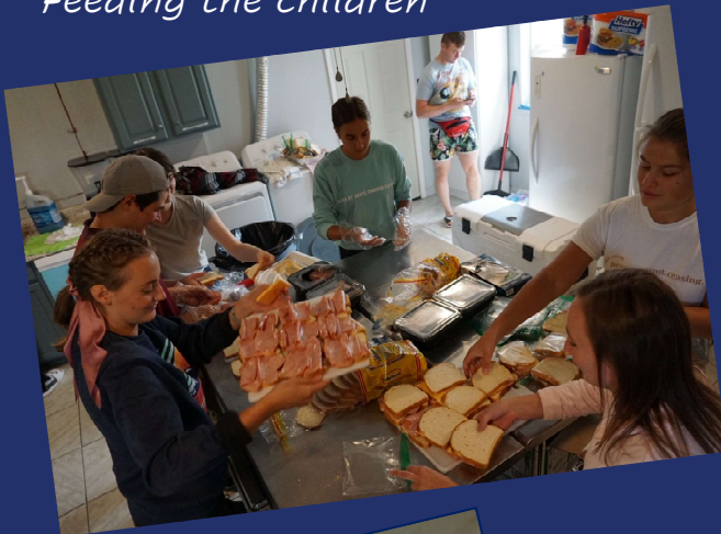
Feeding the children