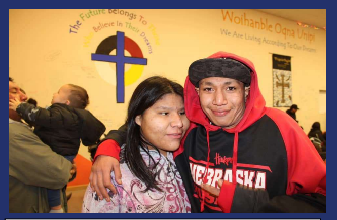
The Dream Center filled with families seeking God's Word. Thank you for all you do to help!

Pray for the innocent children on the reservations please! The youth face isolation, alcohol, abuse, and meth. Hope is eternal through the generations!