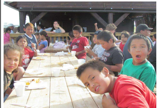
OUTDOOR Cafeteria, soon we will have an indoor one! Keep praying!