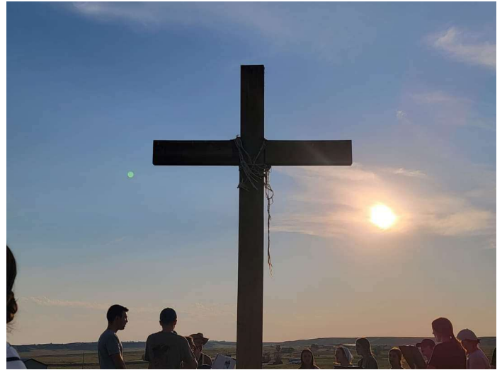
DREAM CENTER CROSS ON THE HOLY HILL

Have a wonderful, fantastic, amazing Christmas Season. May all your dreams come true!